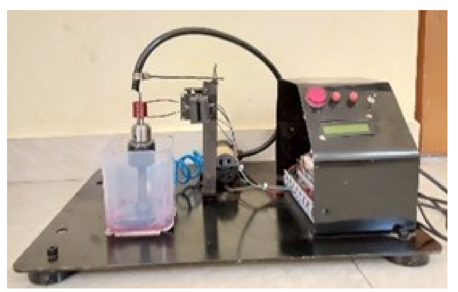
Figure 02: Machine Set-up

Content from this work may be used under the term of the Creative Commons Attribution-Non-commercial (CC BY-NC) 4.0 licence. This license allows refusers to distribute, remix, adapt, and build upon the material in any medium or format for non-